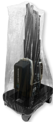
CS Universal Spine Extension™ - Powered Leg Cover