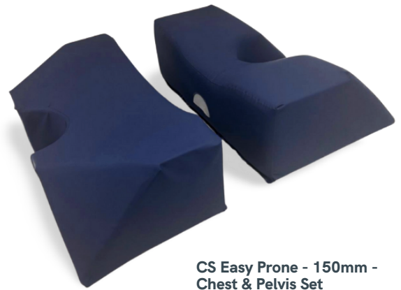
CS Easy Prone - 150mm - Chest & Pelvis Set