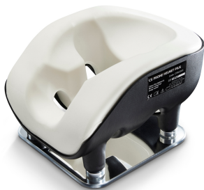
CS Prone Plus Head Support System

Code: CSM-2565 Qty: 1 System (Helmet and Mirror)