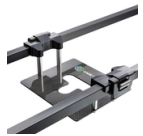
CS Head Tray Attachment - Lowered