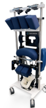
CS Carbon Spine Extension Cart