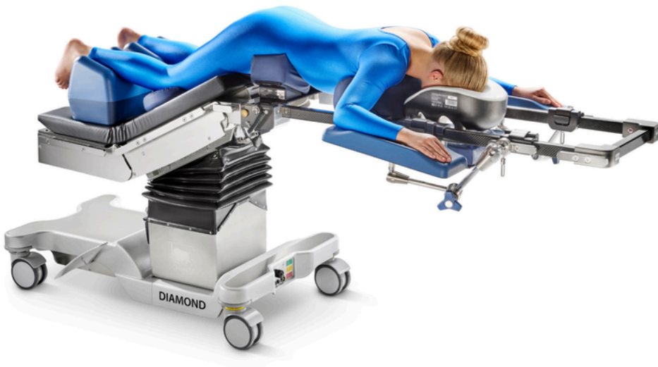
Table can be flexed and reflexed allowing the intervertebral space to be opened and closed with the hand control.