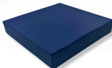
CS Pad 2"