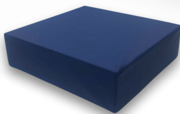
CS Pad 3"