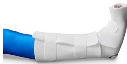
CS Traction Boot Foam Insert