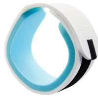
CS Disposable Leg Holder