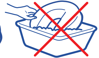
Do not immerse in water