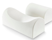
CS Prone Chest and Pelvic Rolls