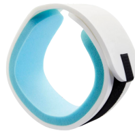
CS Disposable Leg Holder