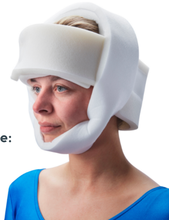
CS Disposable Head Strap