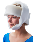
CS Disposable Head Strap