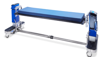
CS- Supine Full Flat Top- Pad Only