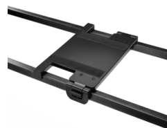
CS Supine Top- Base Only