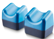
CS Shin Supports (Pair)