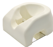
CS ProneOne Head Support