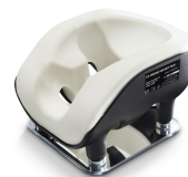
CS Prone Plus Head Support System