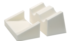
CS Adjustable Prone Leg Cushion