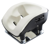
CS Prone Plus Head Support System

Code: CSM-2565 Qty: 1 System (Helmet & Mirror)