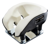
CS Prone Head Support System

Code: CSM-2565 Qty: 1 System (Helmet & Mirror)