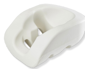
CS Prone Plus Face Cushion

Code: CSM-2560 Qty: 1 System (Helmet & Mirror)