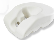
CS Prone Small Face Cushion