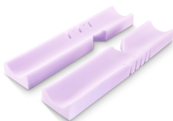
CS Standard Arm Cushions (pair)