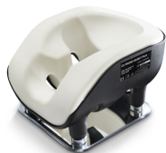
CS Prone Plus Head Support System