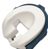
CS Prone C-Flex Compatible Cushion Large