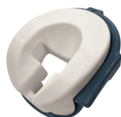
CS Prone C-Flex Compatible Cushion Small