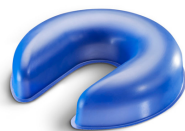
CS Lateral Head Support