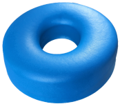
CS Supine Head Support