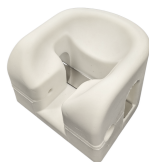
CS ProneOne Head Support - Small